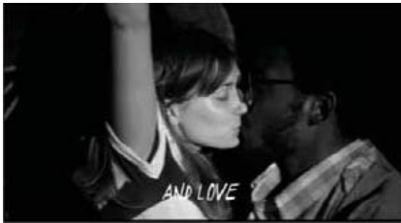
McGinley Image (Ex. A-104)

Less readily apparent is the fact that only the Gordon Image is a still photograph. The McGinley Image is a screen grab from “Levi’s America,” a video montage that combines black-and-white footage of rural and urban Americana. (See Defs.’ Mem., Ex. 3.) The soundtrack to the one-minute video features a solemn and sonorous voice reciting the Walt Whitman poem “America,” as each word or phrase flashes on screen. The allegedly infringing McGinley Image appears at the 51-second mark, spliced between video of a shadowy figure standing on a wooden post and a shirtless adolescent leaping through the spray of sparks from a firecracker.