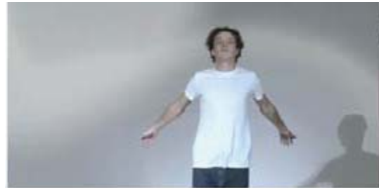
McGinley Image (Ex. A-67)

Plaintiff emphasizes the outstretched arms in all three McGinley Images, as well as the open mouths in Exhibits A-13 and A-66 and the upturned faces in Exhibits A-13 and A-67. But despite these common elements, the “total concept and overall feel” of the allegedly infringing photographs wildly diverges from that of the Gordon Image. The Gordon figure acts in response to the crowd behind him, his arms reaching across the bodies of his companions in a gesture of restraint. By contrast, the figures in the McGinley Images are conspicuously alone. The McGinley Image in Exhibit A-13 captures a moment of private enchantment at sunset. The model spreads his (or her) arms in a gesture of silent rapture; a falling leaf lingers at the bottom of the frame. In Exhibit A-66, the McGinley model thrusts his arms above his shoulders, creating a silhouette that is both stylized and vaguely cruciform. Finally, the McGinley model in Exhibit A-67 extends his arms behind his body, as if to propel himself into flight. A solitary shadow fills the corner of the frame.