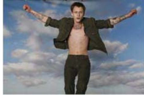
McGinley Image (Ex. A-66)