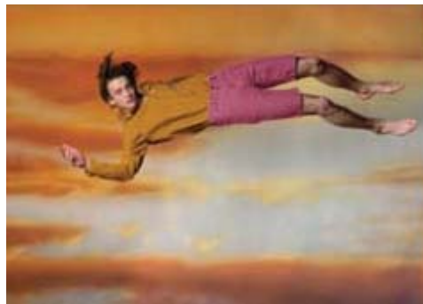
McGinley Image (Ex. A-1)

But there the similarity ends. The Gordon Image is black and white and vertical, while the McGinley Image is in full color and horizontal. The Gordon figure is clothed in a short-sleeve T-shirt, dark pants, and tennis shoes; his hair is closely shorn. The McGinley figure is clothed in a long-sleeve shirt and shorts and is barefoot; his hair is medium-length. Plaintiff attempts to obscure these “peripheral” differences by cropping and rotating the Gordon Image and converting the McGinley image to black and white. (Pl.’s Opp’n 18.) But not even these alterations can reconcile the “total concept and overall feel” of the two images. Tufenkian Import/Export Ventures , 338 F.3d