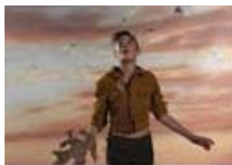
McGinley Image (Ex. A-13)

The three McGinley Images each depict a single figure against the background of a clouded sky ( id. , Exs. A-13, A-66) or a studio backdrop ( id. , Ex. A-67).