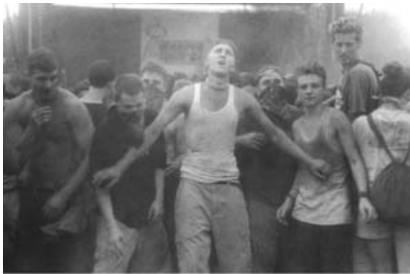
Gordon Image (Exs. A-13, A-66, A-67)

The flaw in Plaintiff’s case is perhaps best illustrated by her allegation that three separate McGinley Images infringe the same Gordon Image, albeit for slightly different reasons. The Gordon Image at issue depicts a crowded street scene in which a central figure gazes skyward while seemingly restraining a throng of young men with his outstretched arms. (Pl.’s Opp’n, Exs. A-13, A-66, A-67.)