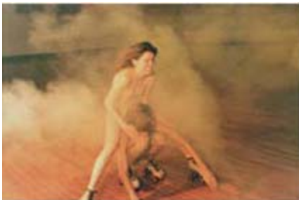
McGinley Image (Ex. A-27)

Once again, Plaintiff attempts to manipulate the comparison, this time by flipping the McGinley image horizontally and superimposing color-coded outlines of the shapes and figures that purportedly correspond. But even granting Plaintiff’s dubious analogy between the motorcycle in the Gordon Image and the crouching roller skater in the McGinley Image, the relationship between the figures remains distinct. The female roller skater sits astride the shoulders of the male roller skater in the McGinley Image, while the stunt biker in the Gordon Image stands adjacent to his motorcycle, touching only the handlebar. The female roller skater faces the camera, smiling broadly, while the stunt biker appears in silhouette, his face concealed by a helmet. In short, “no reasonable jury, properly instructed, could find that the two works are substantially similar.” Warner Bros. Inc. , 720 F.2d at 240.